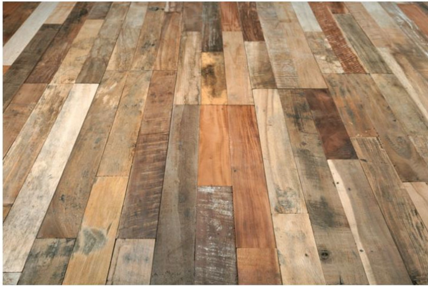
The reclaimed wood by Wonderwall Studios